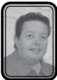
By Gwen Cassel New York