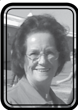
By Jacquelyn Sistrunk Alabama

Questions abound. Would the Panama Canal or the railway be cheaper or faster?